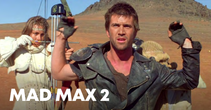
1981, George Miller 96m, Australia R

After avenging the death of his wife and young son at the hands of a vicious gang leader, Max (Mel Gibson) drives the post-apocalyptic highways of the Australian outback, fending off attacks from nomadic tribes that prey on outsiders. Falling into an encampment, Max soon becomes the group's reluctant defender against the hulking Humungus (Kjell Nilsson) and his ruthless marauders.