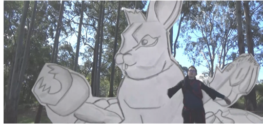
Brain Storm d. Ben Rosenberg & Lawson Boot

Sometimes a bit of isolation is a chance to go surfing, diving, boating and bush-walking and have a perfect day.