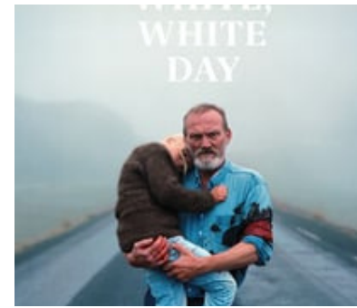
A White White Day

26/28 /31 MARCH CORPUS CHRISTI (POLISH) A pious 20-year-old juvenile delinquent is sent to work at a sawmill in a small town; on arrival, he dresses up as a priest and accidentally takes over the local parish.